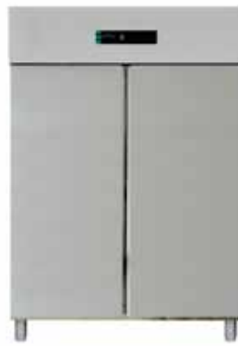
■ UKVR-120 Double Door Refrigerator