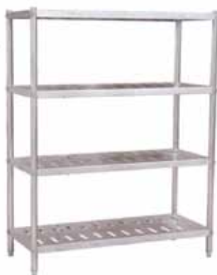
■ UKE-046 Detachable 4 layered SS shelves