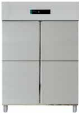
■ UKVF-120 Four Door Vertical Freezer