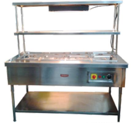
■ UKE-135 Hot Bain Marie with Pick Up & Food Warmer