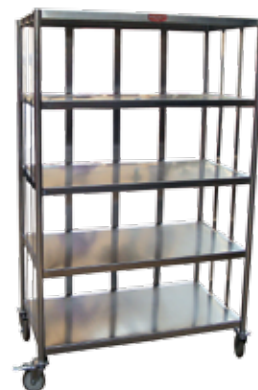
■ UKE-044 Five Deck Shelving Rack Trolley