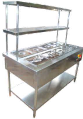
■ UKE-134 Bain Marie with Pick up