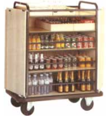
■ UKB-050 Mini Bar Trolley(mother trolley)