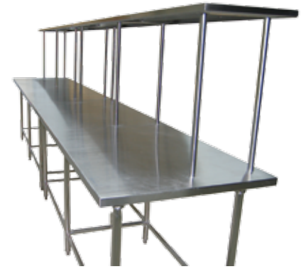
■ UKE-122 Work Table with Upper Shelf/Pickup