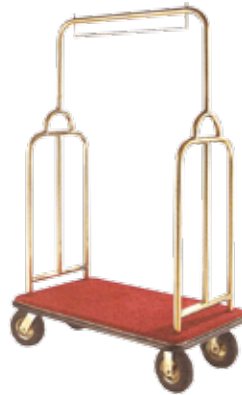
■ ULBT-078 Bell Hop Trolley