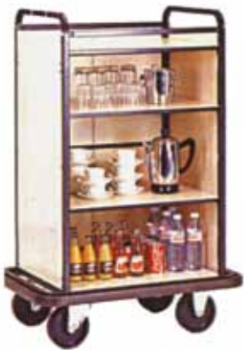
■ UKB-051 Mini Bar Trolley(multi utility)