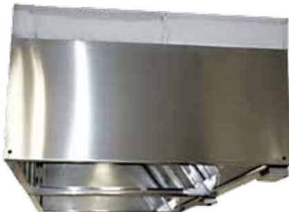
■ UEH-001 Box style Exhaust hood