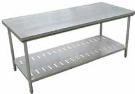
■ UKE-126 Work table with grooved shelf below