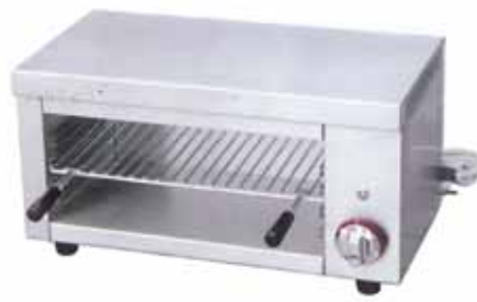
■ UKE-032 Electric style Salamander