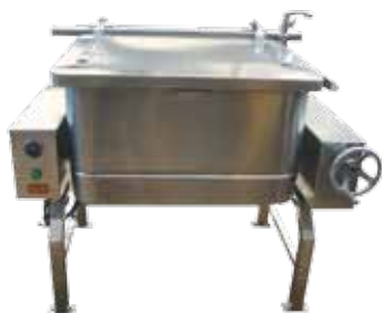
■ UKE-006 Rectangular Tilting Type Bulk Cooker