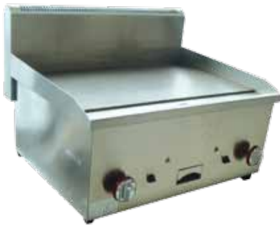
■ UKE-020 Gas Style Griddle