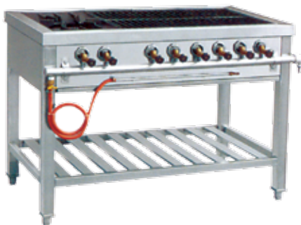
■ UKE-008 Korean Style Barbeque Stove with 8 Burners