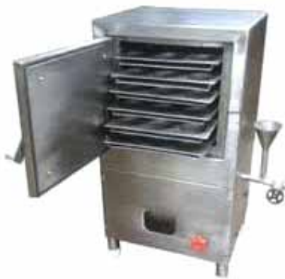
■ UKE-036 Idli Steamer