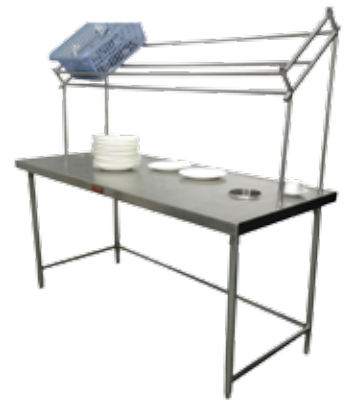
■ UKE-120 Work Table with Garbage chute and glass rack