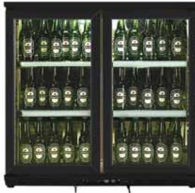
■ UKBC-90 Bottle Chiller