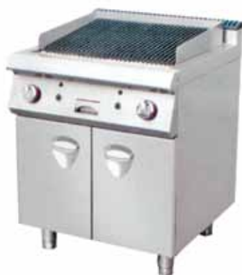
■ UKE-018 Gas Style Griddle with Cabinet