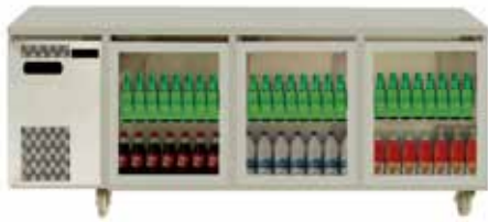
■ UKCR-210S Glass Door Counter Refrigerator