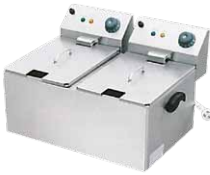
■ UKE-035 Table Top Electric Tank Fryer with double basket