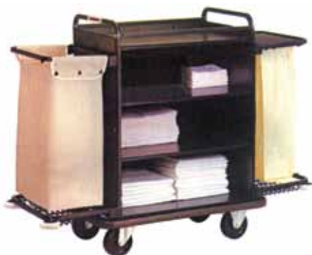
■ UHK-064 Housekeeping Trolley