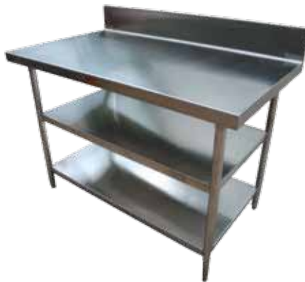
■ UKE-121 Work Table with 2 Under Shelves