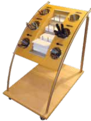
■ UKC-115 Wooden Cutlery Trolley