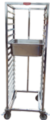
■ UKE-162 GN Trolley with rubber corner bumpers