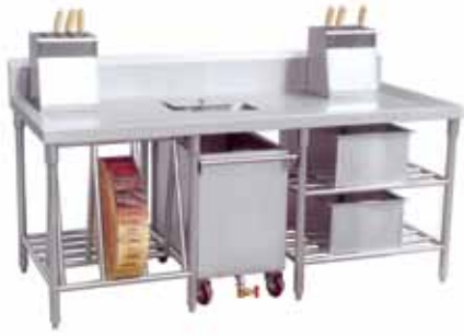
■ UKE-125 Multifunctional Chopping Table