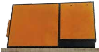
■ UAHU-001 Exhaust Blower with Air Scrubber Unit