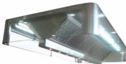
■ UEH-002 Glass Style Display Exhaust hood