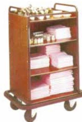
■ UHK-065 Housekeeping Trolley