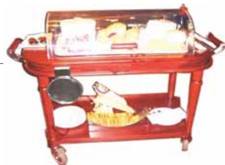
■ UKC-021 Service Trolley_Cheese Trolley