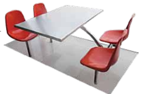
■ UKE-129 Cafeteria Dining Table