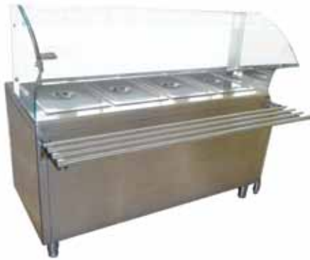
■ UKE-136 Hot Bain Marie with Glass Sneeze Guard & Tray Rail