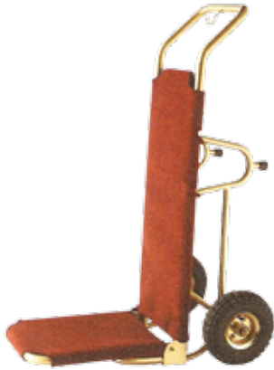
■ ULBT-076 Bell Boy Trolley