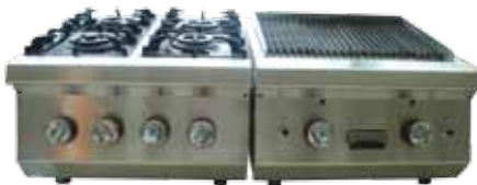
■ UKE021 Table Top Gas Type Griller and Burner Combi