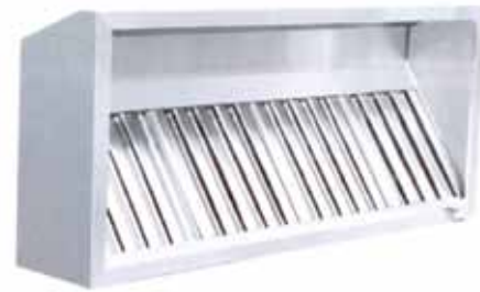
■ UEH-005 Exhaust Hood