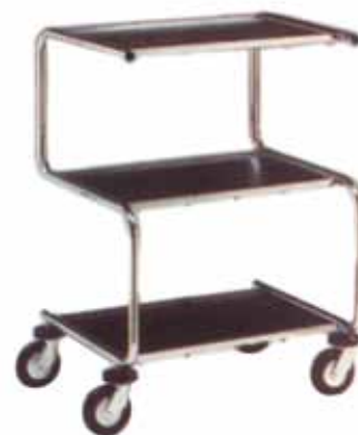
■ UKRS-061 Three Tier Coffee Shop Trolley