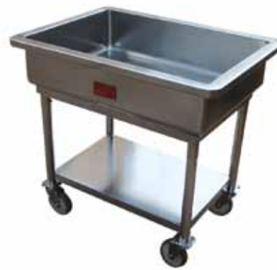
■ UKC-034 Bussing Cart with Under Shelf