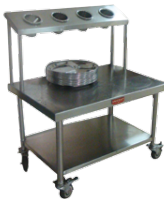
■ UKC-008 Cutlery and Tray Carrying Trolley with Under Shelf Below