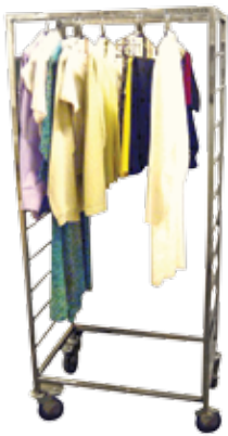
■ UL-072 Hanger Trolley