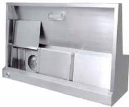
■ UEH-004 Smoke Cover