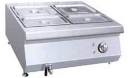
■ UKE-138 Electric Table Top Bain Marie