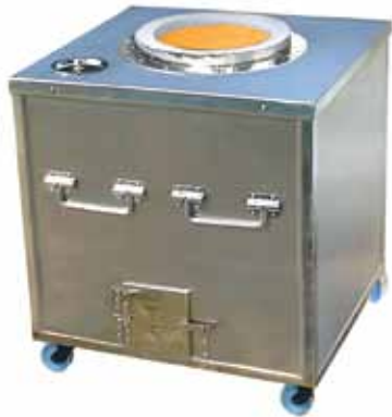
■ UKE-015 SS Tandoor