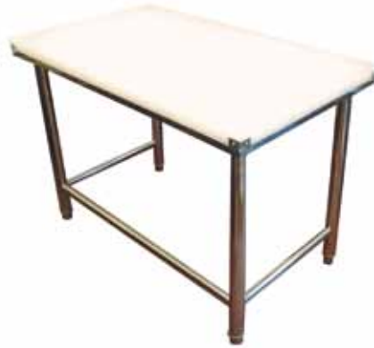
■ UKE-124 Chopping Board Table