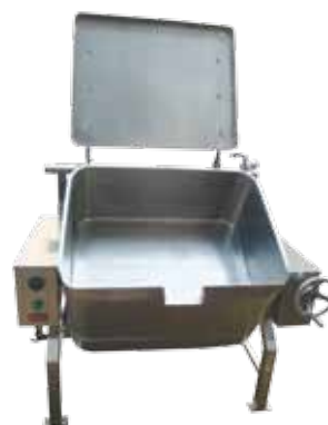
■ UKE-006 Rectangular Tilting Type Bulk Cooker