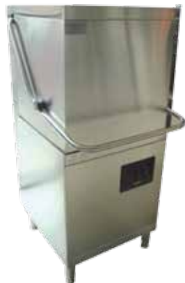
■ UKE-66 Hood Style Dish Washer