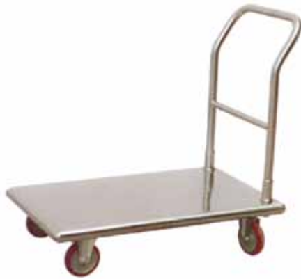
■ ULBT-079 Platform Trolley