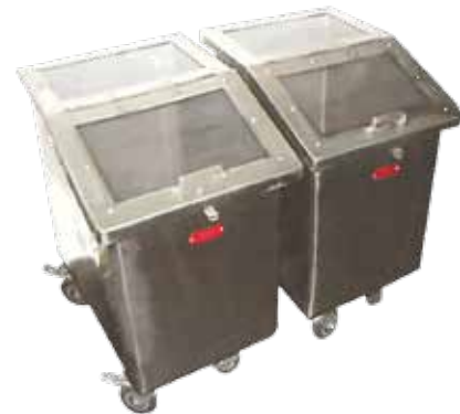
■ UKE 205 Dough/ Sugar/ Rice Keeping Trolley