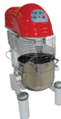
■ UKE-152 Planetary Mixer