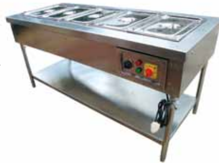
■ UKE-137 Hot Bain Marie