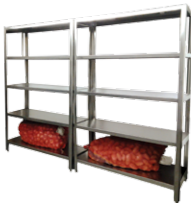
■ UKE-043 Five Deck Shelving Racks