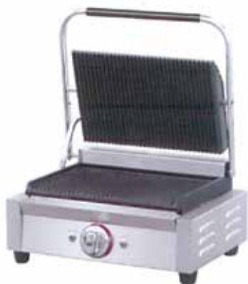
■ UKE-038 Rise-Fall Style Electric Single Sandwich Griller