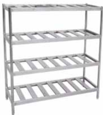
■ UKE-047 4 layered ladder type shelves