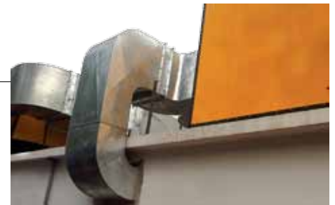
■ UAHU-003 GI ducting