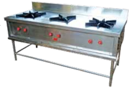
■ UKE-004 Multi-pressure 3 Burner Range