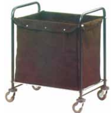
■ UL-070 Soil Linen Trolley