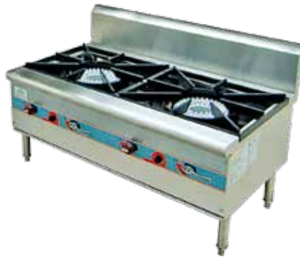
■ UKE-098 Double Burner Stock Pot