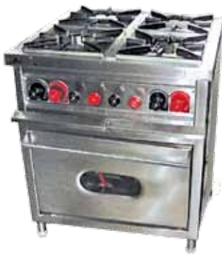
■ UKE-016 Four Burner Range with Oven Below