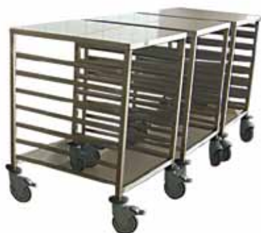
■ UKE-160 GN Trolley