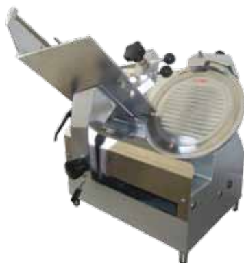
■ UKE-150 Meat Cutter