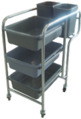
■ UKC-005 Mop Trolley