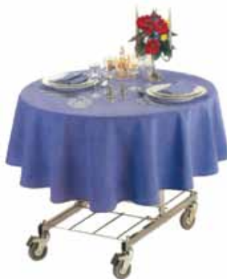
■ UKRS-058 Room Service Trolley with Hot Case Holding