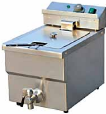
■ UKE-034 Table Top Single Tank Deep Fat Fryer with Oil Drain Tap