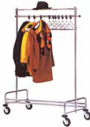
■ UL-074 Hanger Trolley