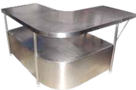
■ UKE-128 Round Shaped Work Table