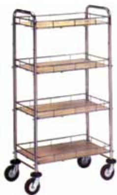
■ UKRS-057 Four Tier Coffee Shop Trolley