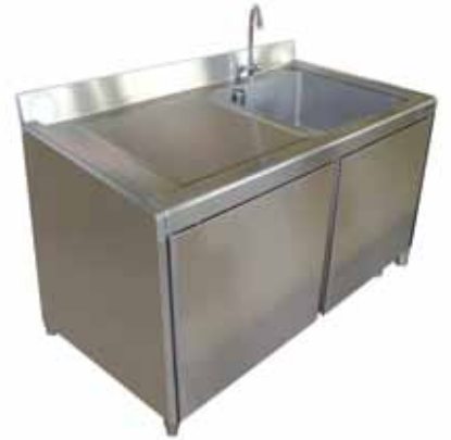
■ UKE-142 Single sink cabinet with left grooved board