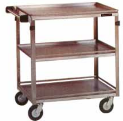
■ UKS-054 Utility Trolley