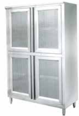
■ UKE-201 Sliding Door Storage Cabinet