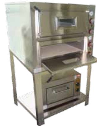
■ UKE-037 Double Deck Pizza Oven