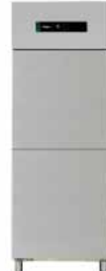
■ UKVR-60 Two Half Door Refrigerator