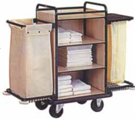
■ UHK-067 Housekeeping Trolley