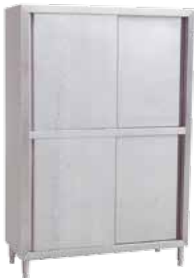
■ UKE-202 Sliding Door Storage Cabinet