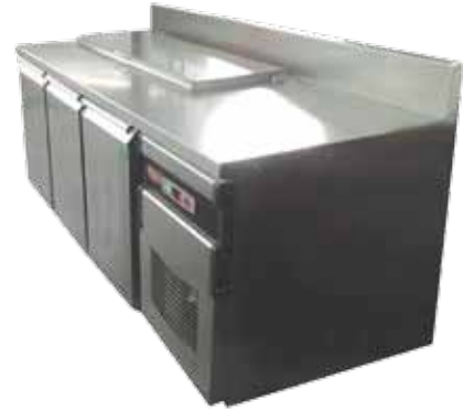
■ UKCR-180 Counter Refrigerator with Salad counter on Top