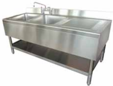
■ UKE-144 Double sink cabinet with left grooved board