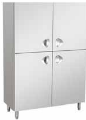
■ UKE-200 Four Door Storage Cabinet