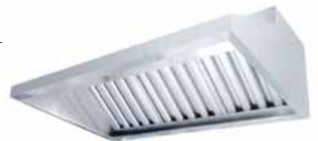
■ UEH-003 Smoke Cover