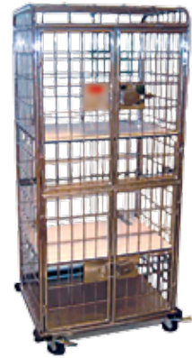
■ UL-071 Fresh Linen Exchange Trolley