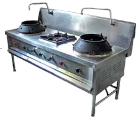
■ UKE-097 Double Burner Range (Chinese Range)