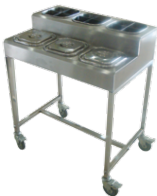
■ UKC-007 Cutlery Cart