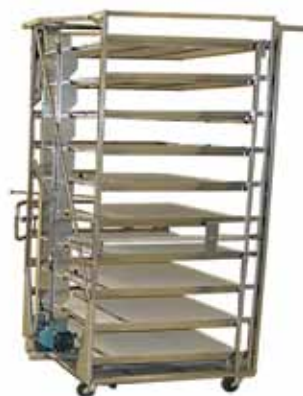
■ UKE-161 GN Trolley