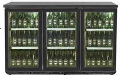
■ UKBC-135 Bottle Chiller