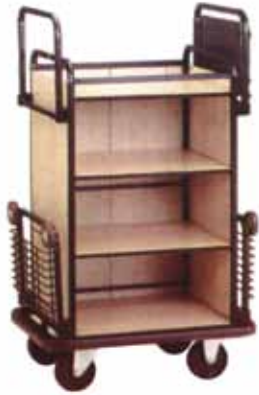
■ UHK-066 Housekeeping Trolley