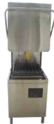
■ UKE-66 Hood Type Dish Washer