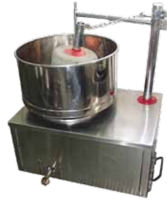
■ UKE-154 Masala Grinder