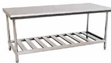
■ UKE-127 Work table with pot rack style drain shelf below