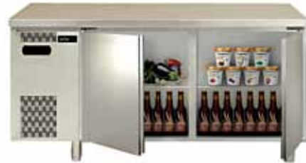
■ UKCR-150 Counter Refrigerator