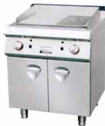
■ UKE-019 Gas Style Lava Rock Grill with Cabinet