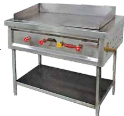
■ UKE-017 Hot Plate