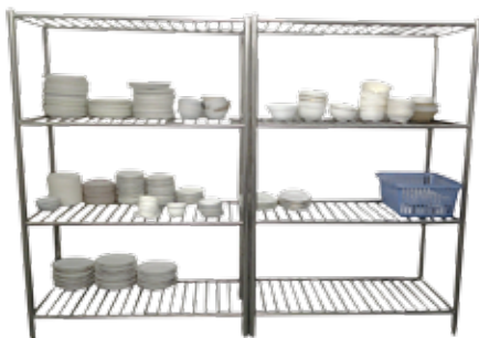
■ UKE-048 Pot Racks