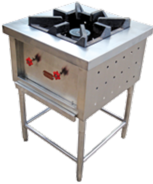
■ UKE-003 Single Burner Range