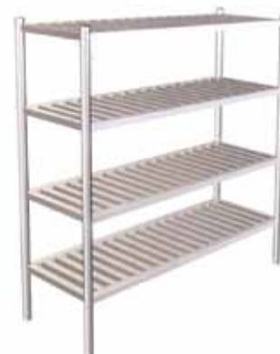
■ UKE-045 Ladder type 4 layered store rack