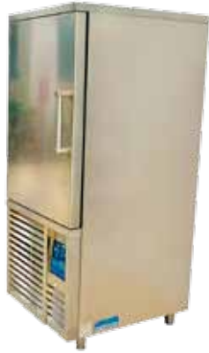
■ UKVR-111 Single Door Vertical Refrigerator