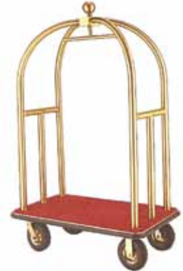
■ ULBT-096 S Bell Hop Trolley