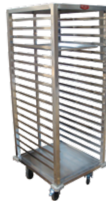
■ UKE-164 GN Trolley with rubber corner bumpers