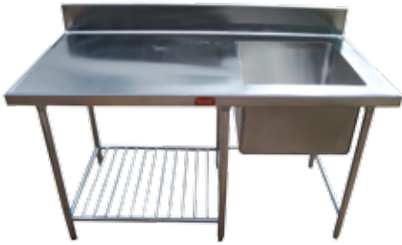
■ UKE-140 Single Sink Unit with Work Table and Drain Shelf below