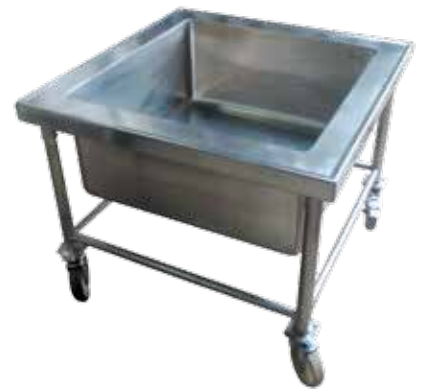
■ UKE-145 Soak Sink