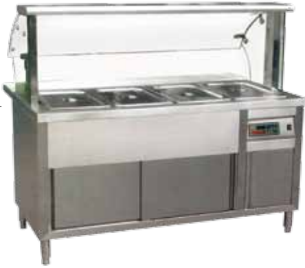
■ UKE-133 Bain Marie with Glass Sneeze Guard