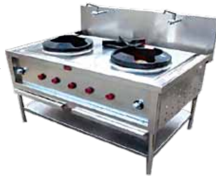
■ UKE-007 2 Burner Kwali Range (Chinese Range)