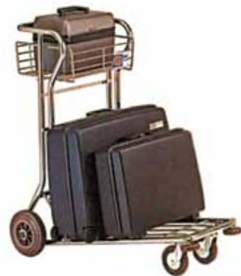
■ ULBT-081 Luggage Trolley