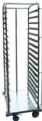
■ UKE-163 GN Trolley with rubber corner bumpers and tray lock