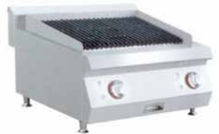
■ UKE-022 Gas Style Lava Rock Grill