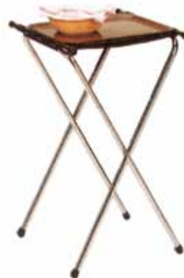
■ UKRS-059 Folding Tray Rack Stand