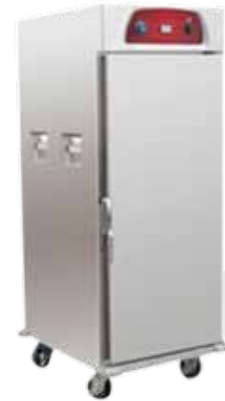
■ UKC-037 Food Warmer Cart Single Door with Shelves