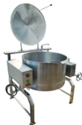
■ UKE-005 Cylindrical Tilting Type Bulk Cooker