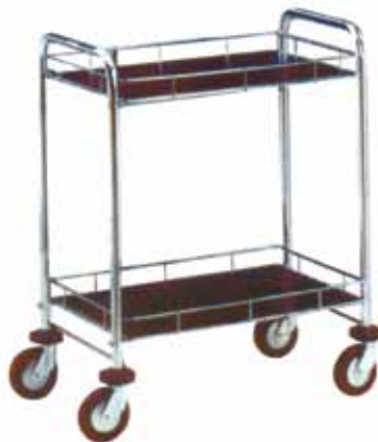
■ UKRS-055 Coffee Shop Trolley