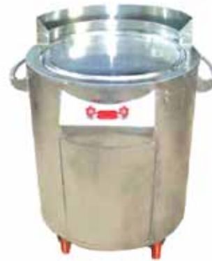
■ UKE-122 Mongolian Tawa