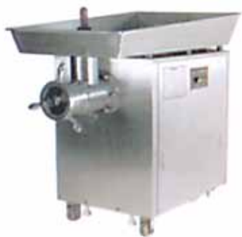
■ UKE-151 Large Scale Meat Mincer