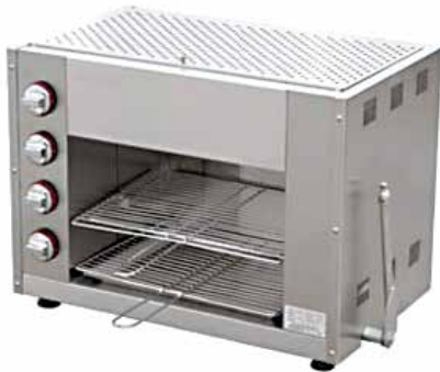
■ UKE-031 Salamander