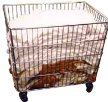
■ UL-069A Dump Trolley