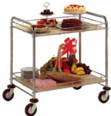
■ UKRS-056 Coffee Shop Trolley