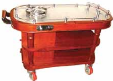
■ UKE-020 Service Trolley_Flambe Trolley