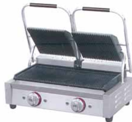
■ UKE-039 Rise-Fall Style Electric Double Sandwich Griller