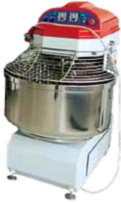
■ UKE-153 Spiral Kneader