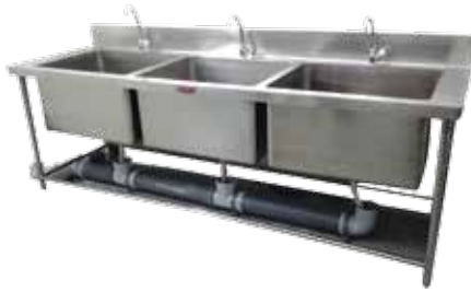
■ UKE-141 Pot Wash Unit/ 3 Sink Unit