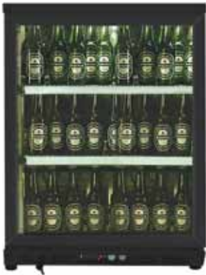
■ UKBC-60 Bottle Chiller