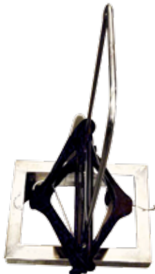
■ UL-073 Hanger Keeping Trolley