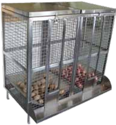
■ UKE-203 Potato/Onion Storage