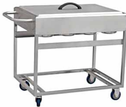
■ UKC-006 Ingredient Cart