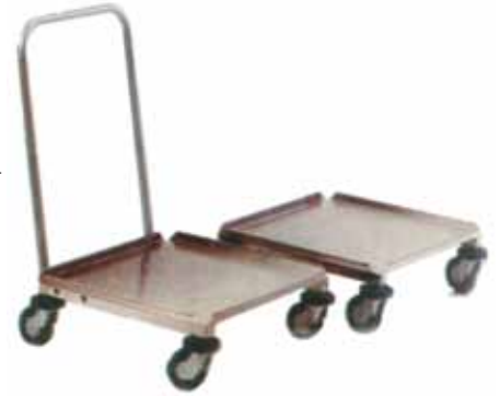
■ UHK-068 Glass Rack Dolley