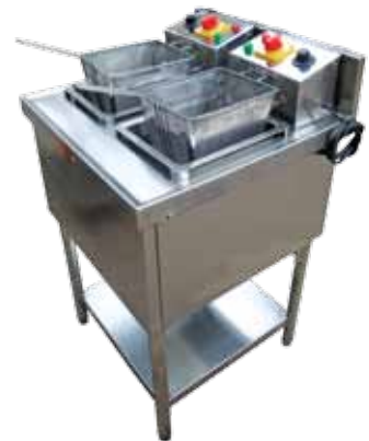
■ UKE-033 Double Tank Deep Fat Fryer with shelf below