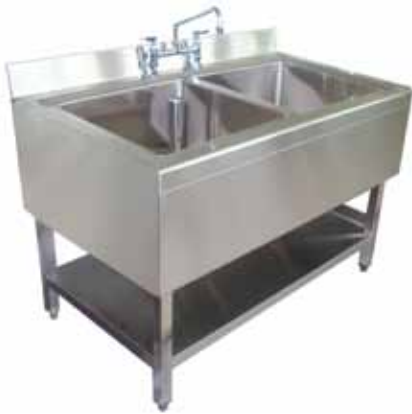
■ UKE-143 Double sink cabinet