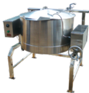
■ UKE-005 Cylindrical Tilting Type Bulk Cooker